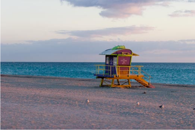
Original RGB image.