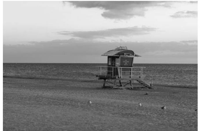
Auto Levels image adapted to meet 5%/95% hypothetical minimum/maximum dot size fingerprint.