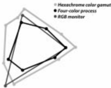
Figure 1.1. Hexachrome color gamut

system for the Macintosh platform (Studio Soft, 1996, p. 2.4).